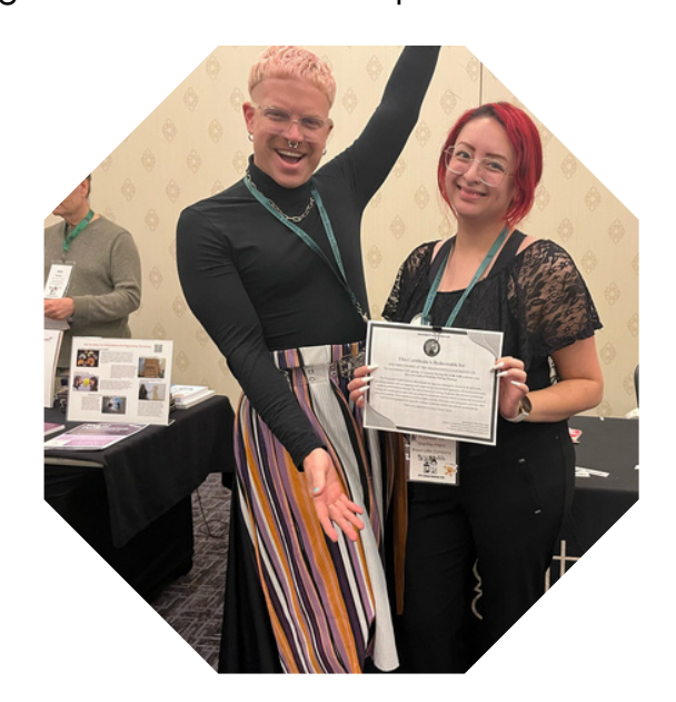
EXHIBIT HALL HOURS:

Sponsor a table at the networking events. Place a targeted 8 1/2X11" message at one of the all-Conference networking events. The cost to sponsor a table is $100.