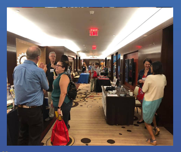
Exhibit Hall Hours:

Thursday, July 28th, 6-9:30 pm (Exhibitor Set Up) Friday, July 29th, 8:30 am-6:30 pm Saturday, July 30th, 8:30 am -5 pm